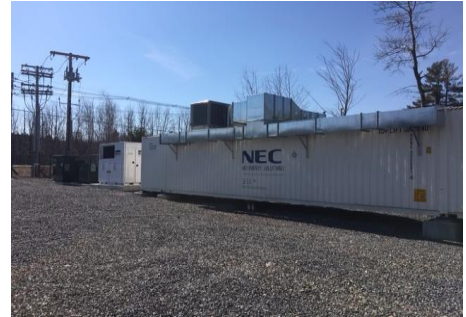
Battery Storage at the Substation on Chocksett Road

Please visit our website for more information on these projects and be sure to watch a video at http://bit.ly/CEG-Sterling on Sterling's Battery Storage Project.