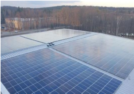
Solar Array and Battery Storage at the RockBreakers Building on Chocksett Road

This event was held outdoors and exposed the attendees to a very cold spring day with temperatures in the low 30's and a brisk northeast wind. So, for a couple of reasons, including the weather conditions and lack of notice for the April 17 th event, I would like to offer everyone another opportunity to visit the Community Solar Project at the RockBreakers Building. In addition to this project we will include a tour of our award-winning Battery Storage Project at our Substation. Both projects are located on Chocksett Road. These tours will be scheduled during our Open House on June 28 th between 11:00 a.m. and 2:00 p.m. If you are interested in taking part in a tour of these projects, please contact our office at 978-422-8267 to sign up in advance.