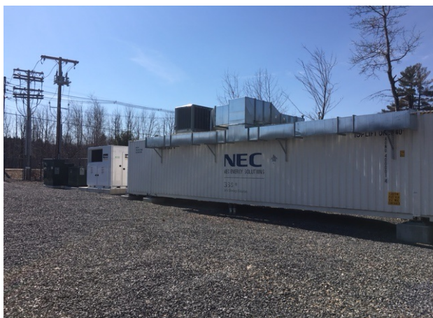
Began Construction October 12,2016 Operating and Captures Peak on 12-16-2016